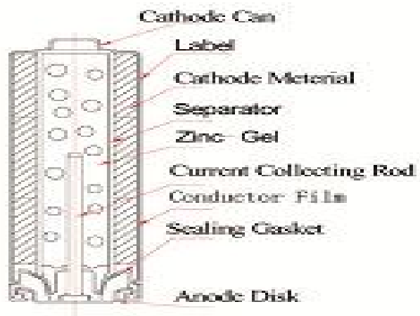
Figure : 2

5.3 Operating temperature: -20^{\circ}\text{C} to 54^{\circ}\text{C} ( 65 \pm 15\%\text{RH} )